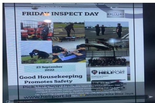
Figure 1. "Friday Inspect Day" Program

The Friday Inspect Day work program poster is carried out routinely by Cengkareng Heliport operational personnel from the safety, operational and technical departments. The poster was shared via status and WhatsApps safety manager group messages in order to remind the Friday Inspect Day work program to all heliport operational personnel.