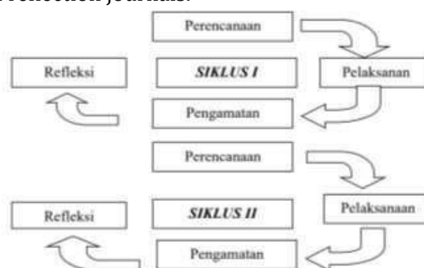
Figure 1. Classroom Action Research Design

This research combines Classroom Action Research (CAR) design with a qualitative approach. This allows researchers to deeply analyze and improve the learning process, as well as gain a better understanding of the effectiveness of the actions taken. Qualitative research is carried out intensively, researchers participate for a long time in the field, record carefully what happens, carry out reflective analysis of documents found in the field, and make detailed research reports (Nasution, 2023: 22). Descriptive research aims to present data systematically, factually and accurately, so that it can describe the conditions or characteristics that actually occur (Ibrahim, 2018: 46). Descriptive research is very effective in describing conditions or phenomena as they existed at the time the research was conducted. "In the context of this research, the researcher wants to know in detail how to improve learning outcomes for history of World War II material through the application of the problem-based learning model in class XII-2 students at SMA Negeri 5 Medan." This research was conducted at SMA Negeri 5 Medan, which is located at Jalan Siswa Number 17, Teladan Timur, Medan, North Sumatra, in the odd semester of the 2024/2025 academic year. All 36 class XII-2 students became research subjects. Data was collected through observation, learning results tests, and reflection journals.