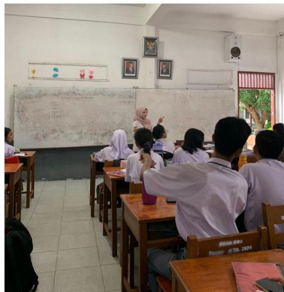
Figure 3. Impletation of the PBL Model Class XII-2 Students