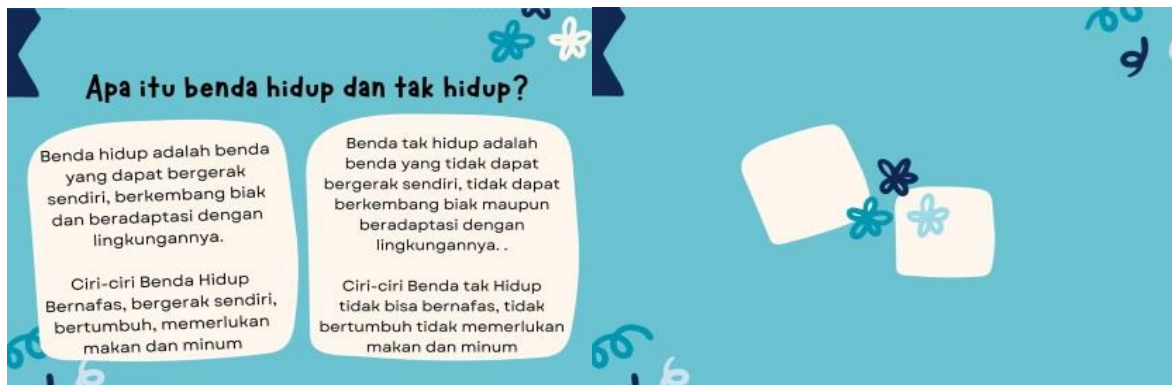
Figure 6. Material Page 3