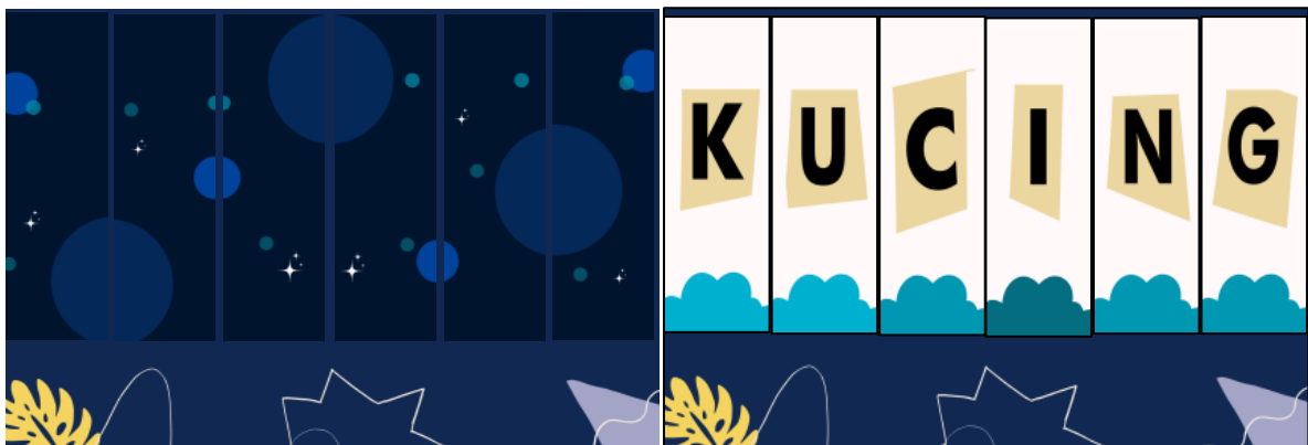
Figure 8. An Example Page for Composing Letter Cards