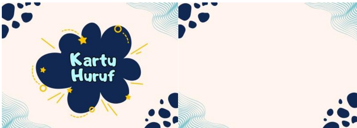
Figure 7. Letter Card Opening Card Page