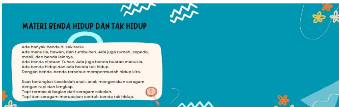
Figure 4. Material Page 1