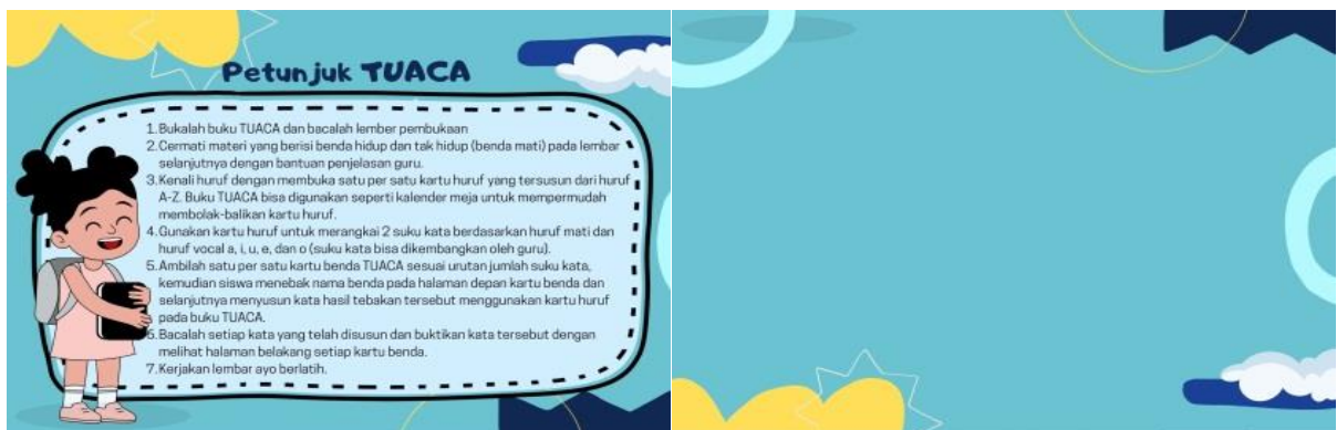
Figure 3. Instructions Page