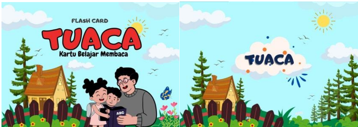
Figure 1. Front and Back Covers