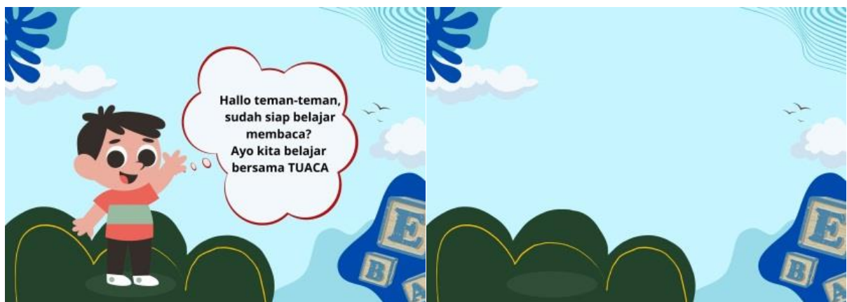
Figure 2. Opening Page