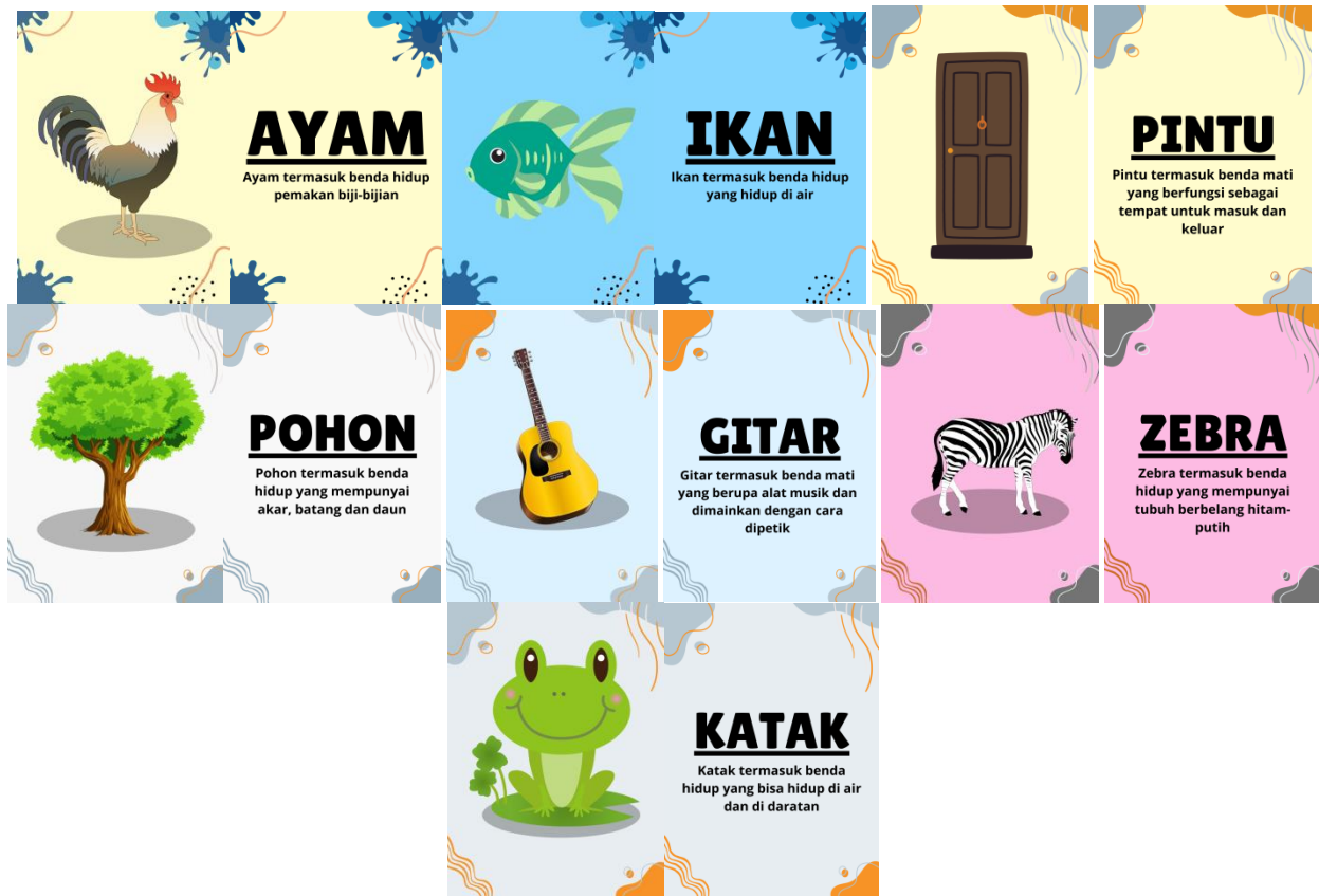
Figure 13. 5 Letter Item Cards