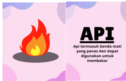
Figure 11. 3 Letter Item Cards