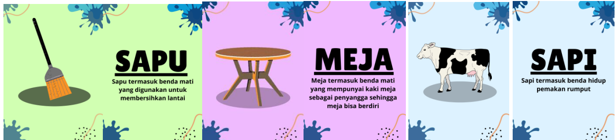
Figure 12. 4 Letter Item Cards