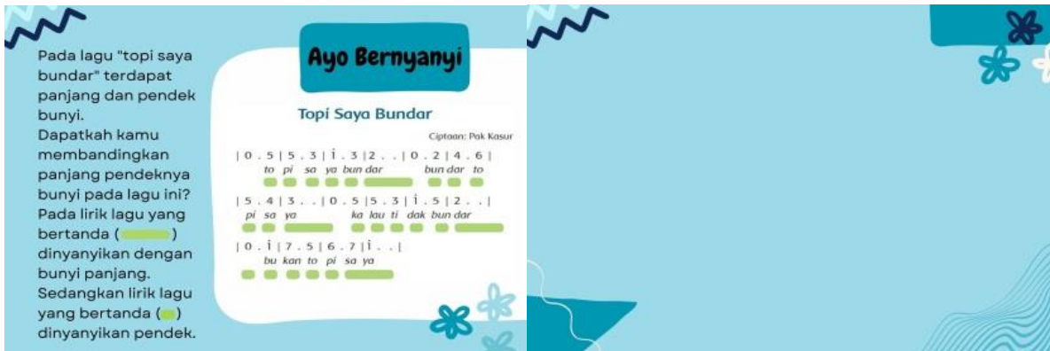
Figure 5. Material Page 2