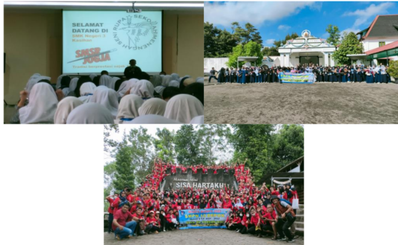
Figure 3. Study Tour Documentation of SMP Negeri 10 Depok to Yogyakarta

Study tours or cultural tours will be held on June 14-18, 2022. The team also participated in the study tour to get an overview of the implementation of cultural tourism activities as a provision for editorial stage activities.