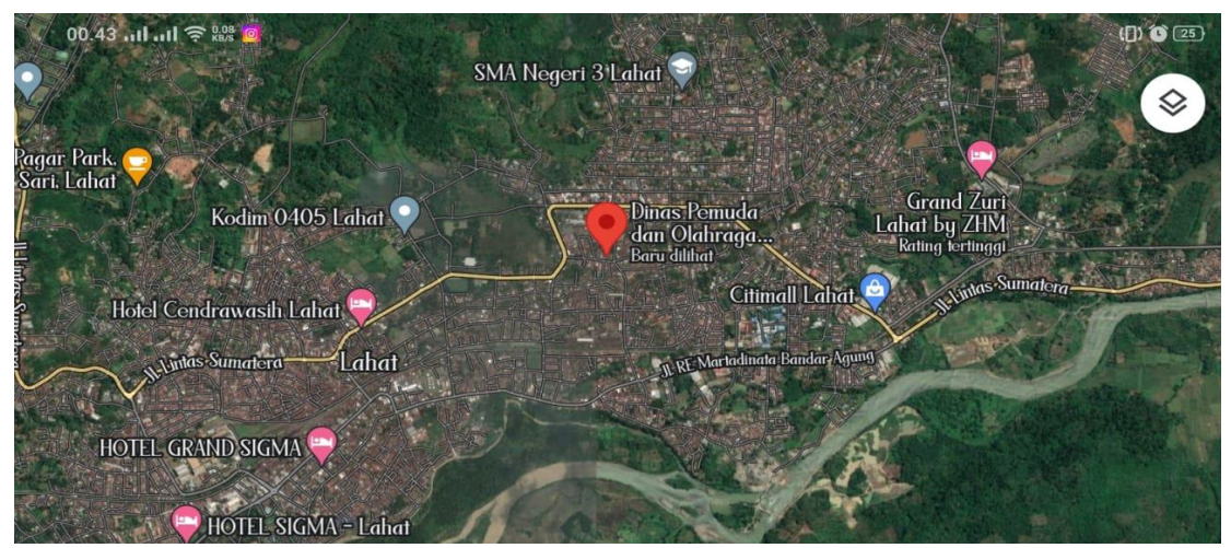
Figure 2. Map of Research Locations in the Lahat Regency Dispora

The Lahat district youth and sports service is located at Jl. Cabbage. H. Barlian, Bandar Iava. District: Lahat. District: Lahat. South Sumatera Province. Postal Code: 31414.