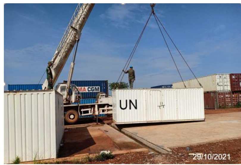
Figure 1. Crane Work for Shifting Incinerator at CWH M'Poko

Of the 122 jobs that were selected in the field of Horizontal Construction, the majority were minor engineering assistance jobs such as crane work and assistance, such as for Shifting Incinerator at CWH M'Poko (Figure 1), front loader assistance (Figure 4.6), and other Minor Engineering for smooth running of the mission. Not only that, the Task Force has also completed several horizontal construction works such as land clearing, for example in the Nola West Sector on March 1, 2022 (Figure 4.7), Trench and embankment work in Carnot. (Fig. 4.8)