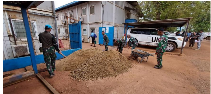
Figure 6. Construction of an FC garage at UCATEX

Apart from contributing in the form of construction work, the Kizi Konga 37-H MINUSCA Task Force also made a major contribution in the field of EOD. EOD-related works carried out included hand grenade evacuation, cleaning of areas suspected of being a mine/IED threat in the West Sector, identification of anti-tank mines in Binawayo village, disposal of anti-tank mines in Binawayo village, cleaning and disposal of 3 UXO in Boali, identification, evacuation and disposal of hand grenades in Lambi village in Boali, Disposal of expired ammunition and 2 UXO containers at the Kassai shooting range in Bangui.