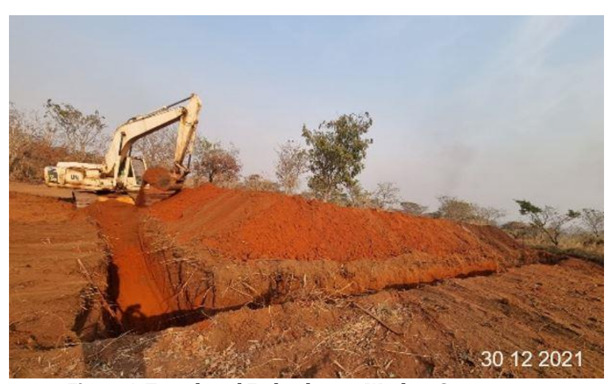
Figure 4. Trench and Embankment Work at Carnot

In addition to the assistance of cranes and backhoe loaders, the Kizi Konga XXXVII-H/MINUSCA Task Force has also carried out other minor engineering work such as work and assistance with forklifts, dump trucks, loaders, grreaders, excavators, fork lifters, etc. For horizontal construction, apart from land clearing and concertina improvement, the Kizi Konga XXXVII-H/MINUSCA Task Force has also carried out road access improvements, laterite backfilling, leveling and compaction, ditching and embankment construction, airport expansion, WWTP installation, TPS cleaning, cutting grass lines., river cleaning, etc.