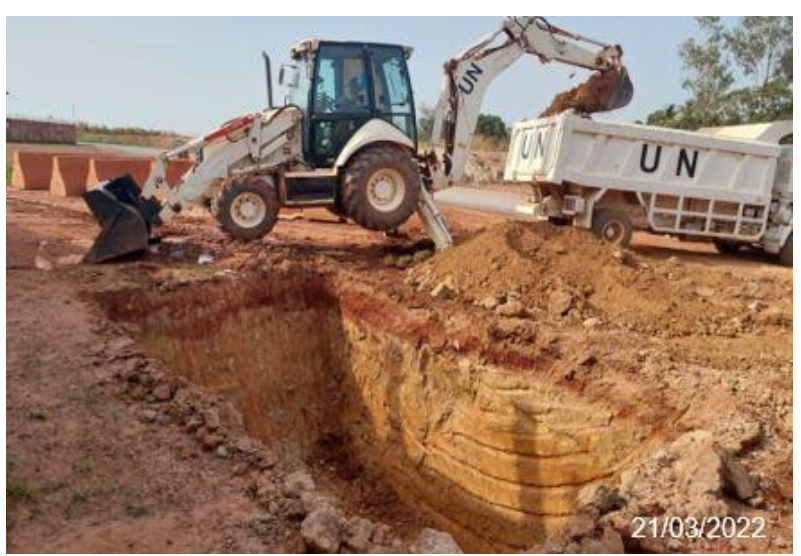
Figure 2. Backhoe Loader for Digging a Septic Tank Immersion Hole in the M'Poko Green Field