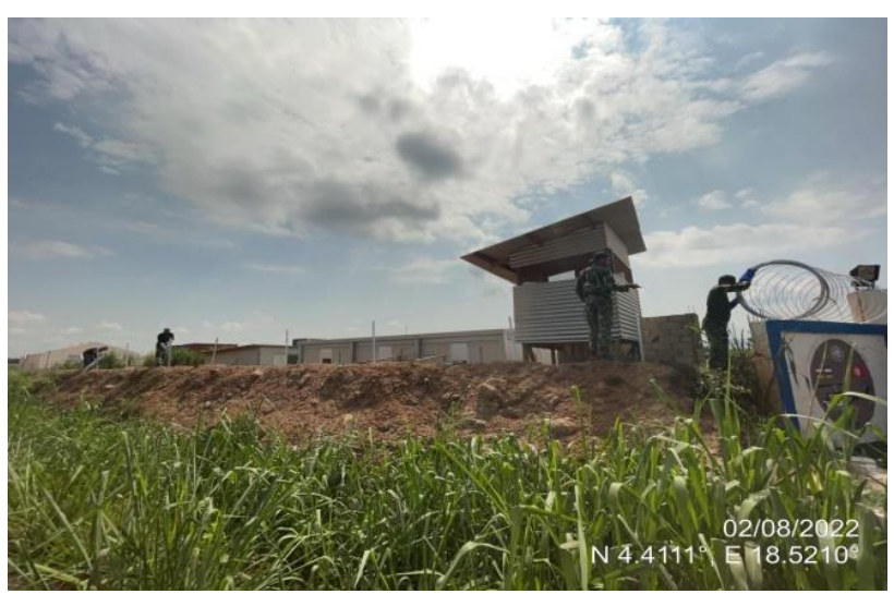
Figure 5. Installation of Concertina Wire at Tunav Camp in M'Poko

installation in several places, such as the SRSG residence on May 13 2022, at Tunav Camp in M'Poko on 2-6 August 2022 (Picture 5), UCATEX on 17 March-7 September 2022. In addition, the Task Force also repaired the radar at the M'Poko Warhouse, repaired the tower location at the PK 4 warehouse, and built an FC garage at UCATEX on 22 -24 September 2022. (Fig. 6)