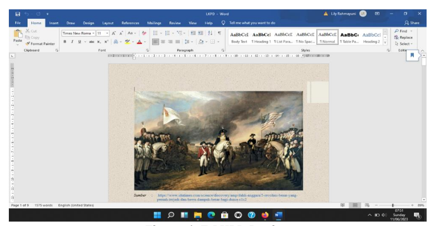
Figure 1. E-LKPD Design

The design stage is the media planning stage which includes making a website-based E-LKPD design in history subjects, namely conducting curriculum analysis, compiling a map of LKPD needs, determining LKPD titles, writing LKPD. The following is the design of the E-LKPD as follows: